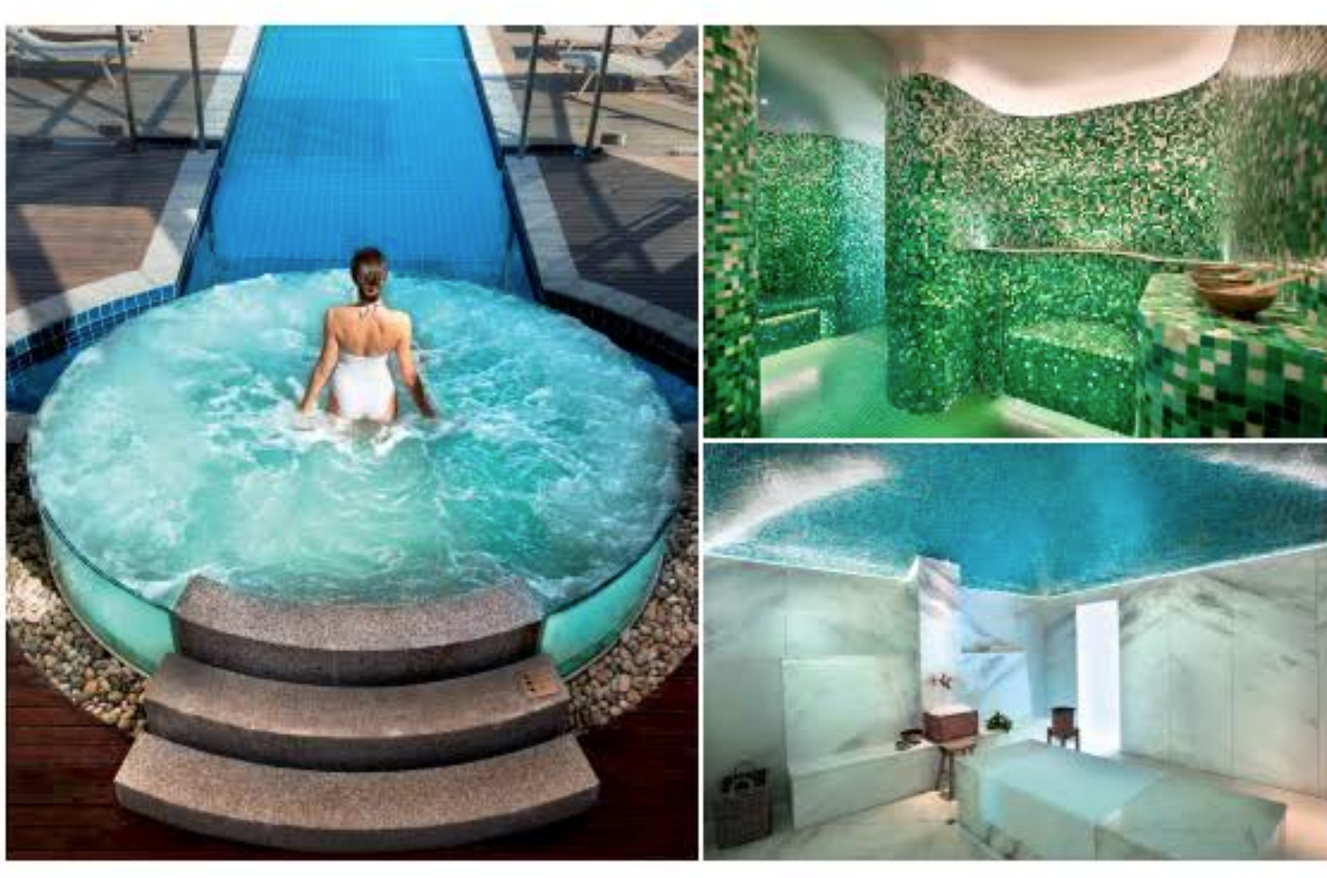
TOP RIGHT: All the hidden gens and amenities of the gurden and hot spas are open to both hotel guests and day spa visitors. CLOCKWISE FROM ABOVE: One of two indoor heated vitality pools has an outdoor waterway. The undulating walls of the rasul, covered in mosnic tiles in shades of iridescent green and aquamarine, set the scene for an experience that draws on ancient purification rituals. The double hammam, constructed entirely from white Carrara marble under a domed ceiling of Bisazza mosaic tiles, offers a private water ritual for couples. OPPOSITE: The finishes of the new hot spa are standout features and serve to frame and enhance the splendour of the gardens rather than obscure it.