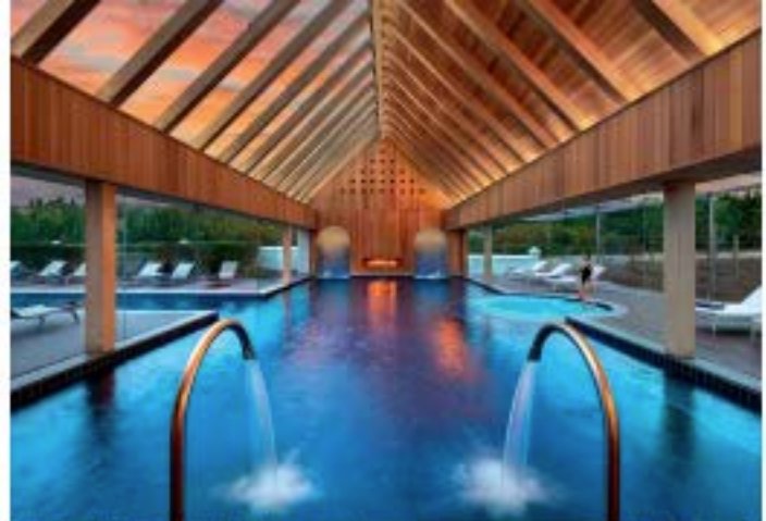
RUGHT: The spacious new addition to the hot spa features Western red cedar avoid and two contrasting Bisazza mosaic elle alcoves. The glass roof tiles let in an abundance of light during the day, and a view of speciacular summers and warry thies at night. BELOW: The beach climated between the gurden spa and new hot spa is a secinded alcove, nurrounded by a man-like hodge of bamboo.