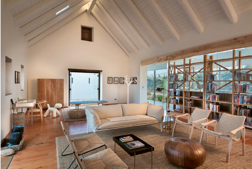
THE DESIGNER FARM STAY